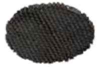
14AANDM TERES EXTE MEDIUM Honeycomb optic.