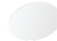
14AAVTM TERES EXTE MEDIUM Transparent Glass.