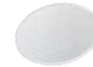
14AASLS TERES EXTE SMALL Sculpture optic.