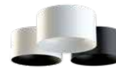
14AA80AGW: Teres Small White RAL 9003 ring.

Anti-glare rings allow users to focus the beam of light whilst hiding the actual light source. They are ideal for use in projects such as art galleries, museums and retail areas to ensure merchandise & artifacts are perfectly lit without any annoying glare issues.