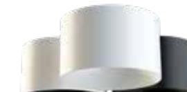
14AA110AGW: Teres Medium e HF White RAL 9003 ring.