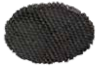
14AANDS TERES EXTE SMALL Honeycomb optic.