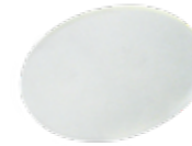
14AAMGLV TERES LV Frosted Glass.