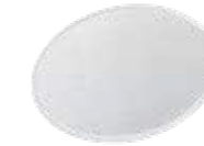
14AASLLV TERES LV Sculpture optic.