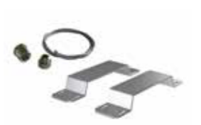
02AA1330 Single wire 3000mm long adjustable suspension kit.