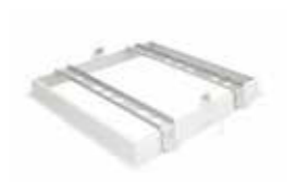
02AA17: 317mm module 02AA172M: 627mm module Housing for recessed installation.