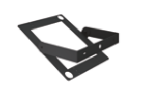
02AA15: 317mm module 02AA15252: 627mm module Bracket for wall installation.