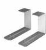
02AA14BS Brackets for busbar.