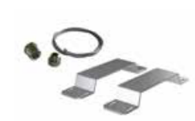
02AA13 Single wire 1500mm long adjustable suspension kit.